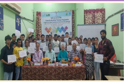
Fragrance & Flavour Development Centre (FFDC), Kannauj commenced training program under NSSH on Essential/Aromatic Oils (29th Sept - 13th Oct'2023)