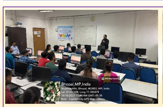
Centre for Research and Industrial Staff Performance (CRISP), Bhopal commenced training program under NSSH on "Solar PV Installer" (5th Sept - 18th Dec'2023)