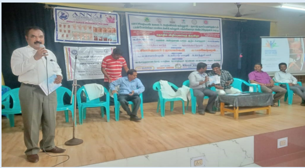
NSSHO Chennai organized Awareness Campaign on NSSH scheme on 06.03.2024