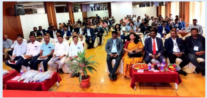
NSSHO Bengaluru organized Awareness Programme on NSSH Scheme on 10.01.2024