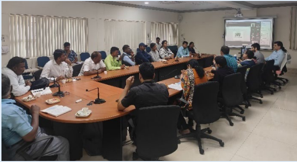
NSSHO Bengaluru participated in a VDP with FCI on 16.03.2024