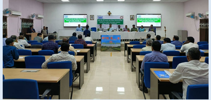
NSSHO Odisha organized SVDP with NTPC at Kaniha, Angul, Odisha on 08.02.2024