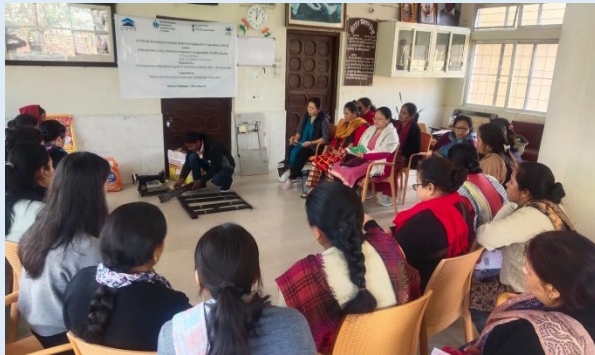
EDI Ahmedabad training program in Kerala on Entrepreneurship Development which concluded on 29.01.2024