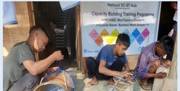
NEHDC organized Bamboo Work Artisan Training in Mon, Nagaland which concluded on 9.03.2024