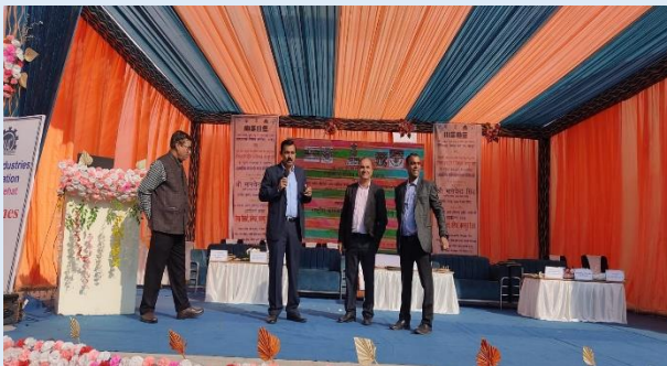
NSSHO Lucknow participated in a VDP with MSME, ALIMCO & HAL on 18.12.2023