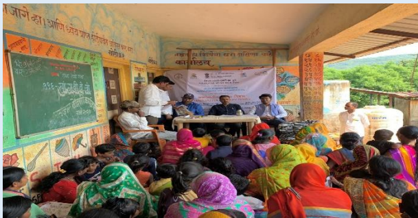
NSSHO, Pune organized Awareness Campaign on NSSH scheme on 24.11.2023