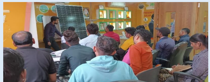
Centre for Research and Industrial Staff Performance conducted training program on “Construction Solar PV Installers” which concluded on 18.12.2023