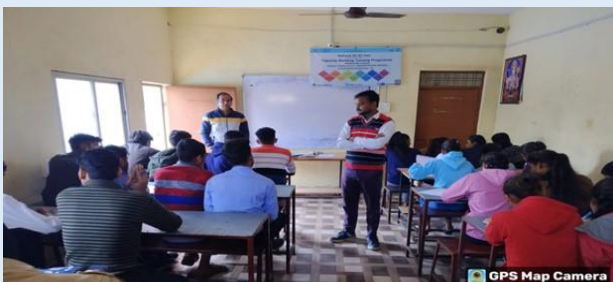
HARDICON conducted training program on “Construction Electrician” which concluded on 12.12.2023