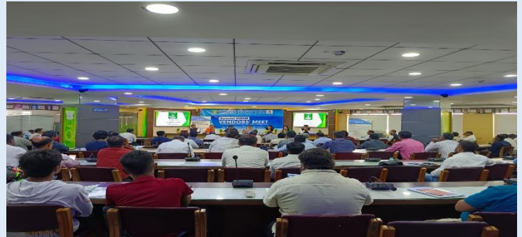
NSSHO Bangalore organized SVDP with Mangalore Refinery and Petrochemicals Limited and E-Tendering training on 14.12.2023