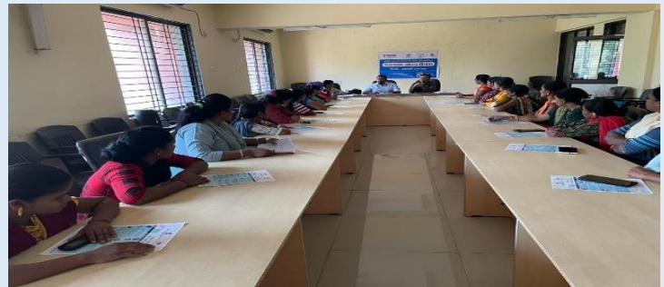
NSSHO Surat organized Awareness Programme on the occasion of “Janjathiya Gaurav Divas” on 24.11.2023